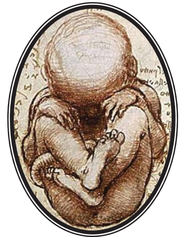
Leonardo da Vinci, 15th Century