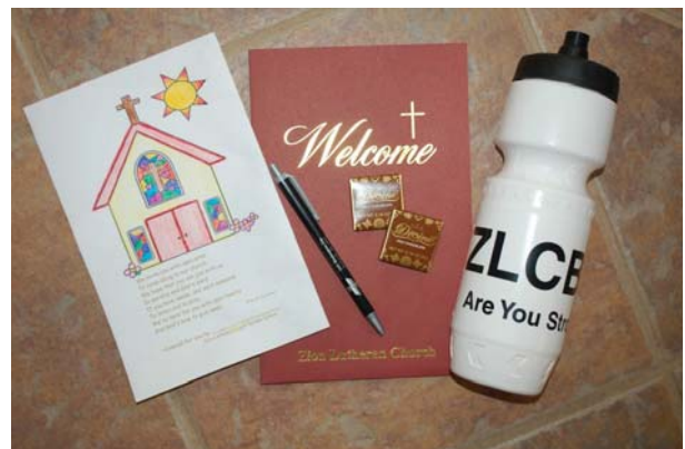
Welcome Packet Contents

Weird Animals are coming to Zion! Mark your calendars - June 23 - 27th