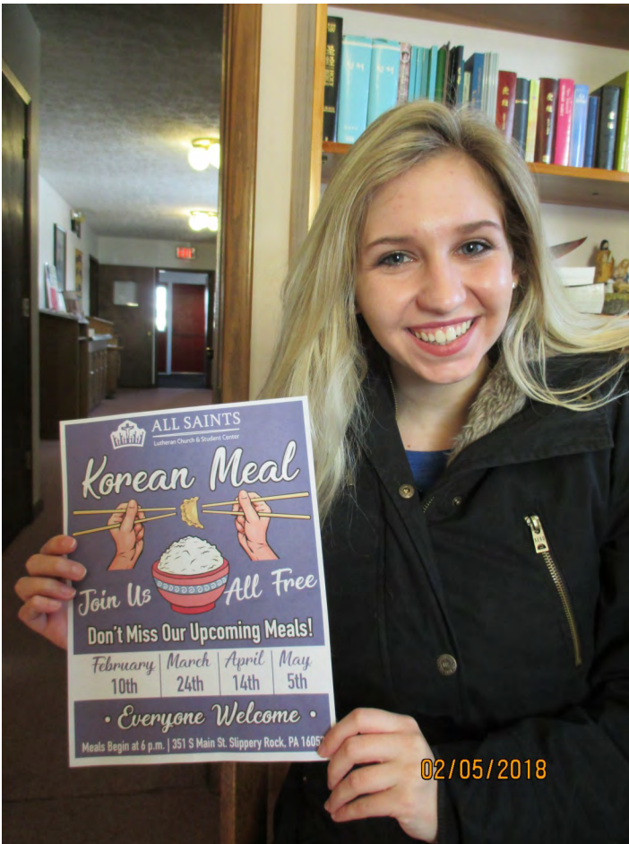
All Saints Ambassador.

Love for All Saints campus ministry means seeking every way possible to open doors to these moments when we can share the Gospel with students. Please pray for our work with students.