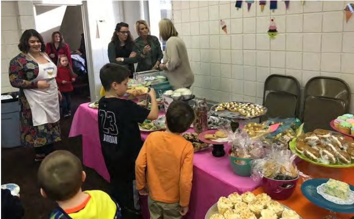
Bake Sale was seeing lots of action with such yummy treats!