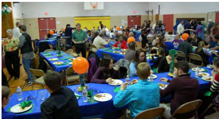
Finishing dinner before awards at Redeemer's annual athletic banquet.

Redeemer's annual sports banquet was held on Friday, March 16. Students, families, and coaches gathered to recognize the hard work of each player and give appreciation to the coaching staff. Of course, the evening was made extra special as we celebrated our middle school boys' basketball team becoming SWCAC champions. Thank you to everyone who made the athletic year possible, and to all the volunteers that organized the evening.