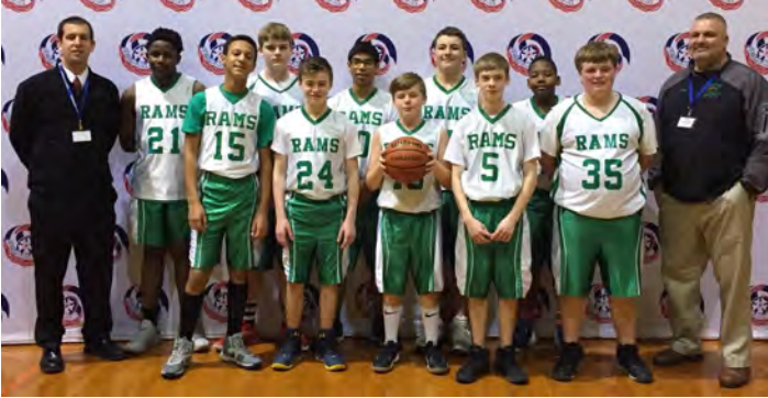
Redeemer middle school boys' basketball team at the LBAA tournament.