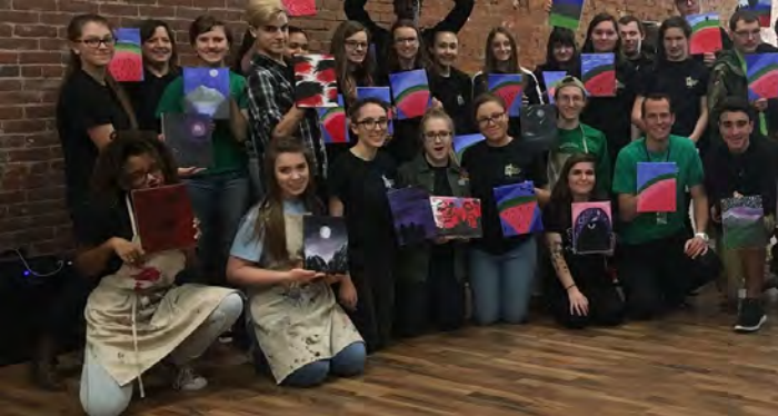
RLHS students enjoy a painting workshop.

The rest of our student body enjoyed special field trips for the morning. 5th and 6th graders visited the Audubon Society and Beechwood Farms for a wonderful time of discovering nature and worshipping in an outdoor chapel service. 7th and 8th grade middle schoolers drove to Nesbit Lanes in Plum after chapel for some bowling and pizza. High schoolers held chapel together at Redeemer Church in Oakmont and then headed to an art studio in Butler for a special painting workshop.