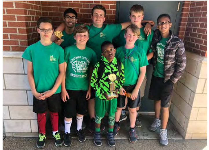
RLS middle school boys take 1st place overall at area track meet.