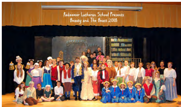
Redeemer Lutheran School Beauty and the Beast cast.