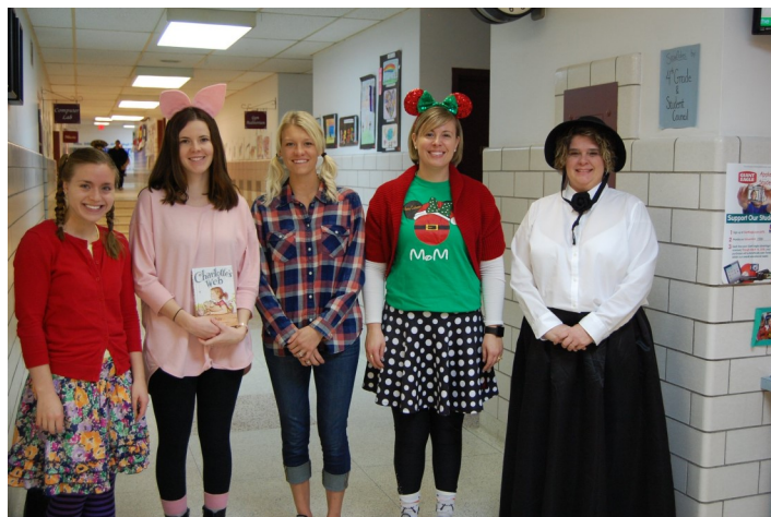
Elementary teachers enjoying Meet the Author Day.

Redeemer celebrated National Lutheran Schools Week January 21-27 together with LCMS schools all around the country. It was a terrific, activity-filled week. Monday's focus was Author Day, with teachers and students alike wearing the costumes of their favorite books. Our middle school students spent the morning participating in special activities with our preschoolers, which is always a highlight for our littlest students.