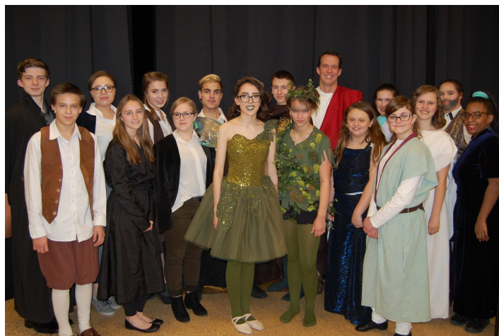
"A Midsummer Night's Dream" Shakespeare cast.