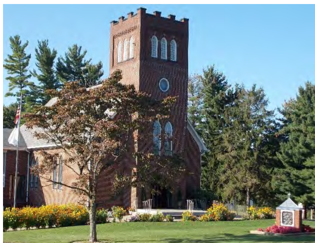
Faith Lutheran Church (below)