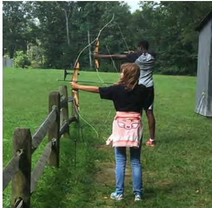
Middle schoolers try out archery at Camp Allegheny

Over 280 students walked through the doors at Redeemer's two campuses for the first day of school on Wednesday, August 22. Our middle and high school students began the year with their annual teambuilding retreat. This year's retreat was held at Camp Allegheny, a Christian camp near Ligonier. Students participated in devotional times, outdoor games, and other activities to encourage leadership and bonding. The retreat culminated with a visit to the Flight 93 memorial.