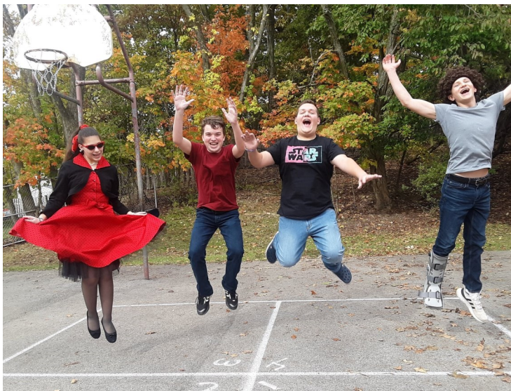
Elementary students learn about Martin Luther and Reformation Day

Upcoming events: RLS will be presenting a live drive-through Nativity at the Penn Hills campus on Saturday, December 11 th , from 5:00-6:30 p.m. We are excited to share the gospel in our community in this way! Check rlspittsburgh.org for signup details to come soon. You may also contact the school office at 412-793-5884 or school@redeemer-oakmont.org for more information.