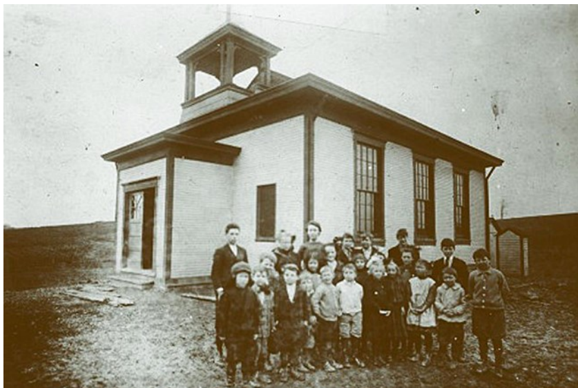
Ingomar Elementary School Built in 1910 One Teacher 22 students. Ingomar Elementary used to look like this. It was a good old-fashioned one-room schoolhouse. It was added onto over the next few decades before being destroyed in a fire in 1960. The current Ingomar Elementary School subsequently was built on the same site.

When I was in school from First Grade until I was 12 the school day started with The Lord's Prayer and the Pledge of Allegiance. In 1963 The Lord's Prayer was banned but the Pledge of Allegiance stood.