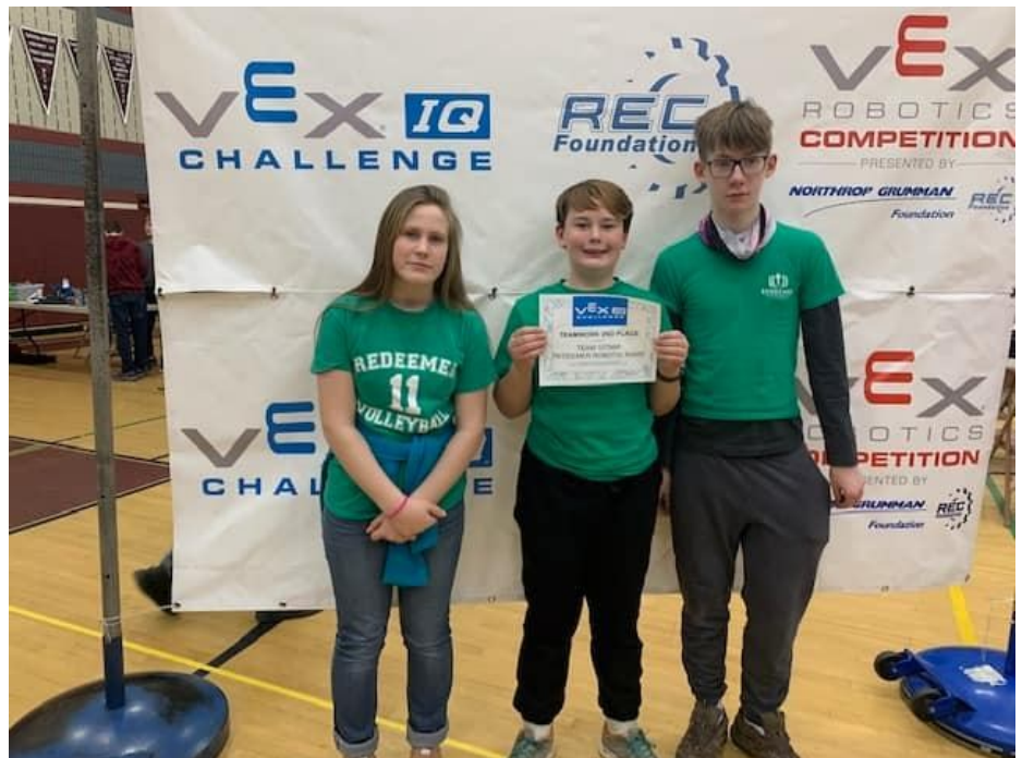
Robotic Rams take 2nd place in state competition