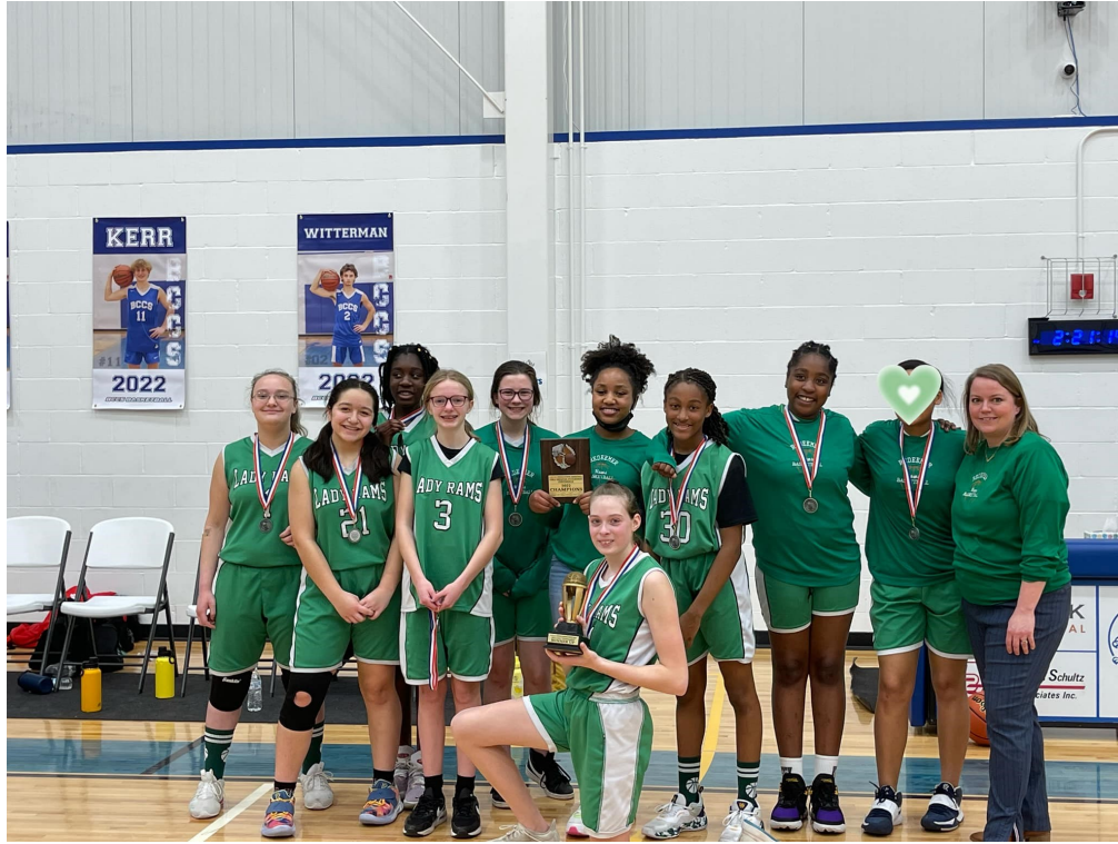
RLS middle school girls basketball team takes 2nd place