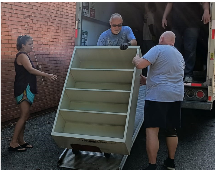
"Two Guys and a Truck"-- some of our helpful volunteer moving men!