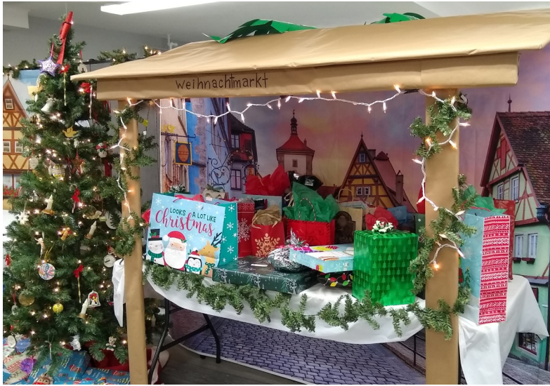
Christmas party - a "German Christmas Market Stall"