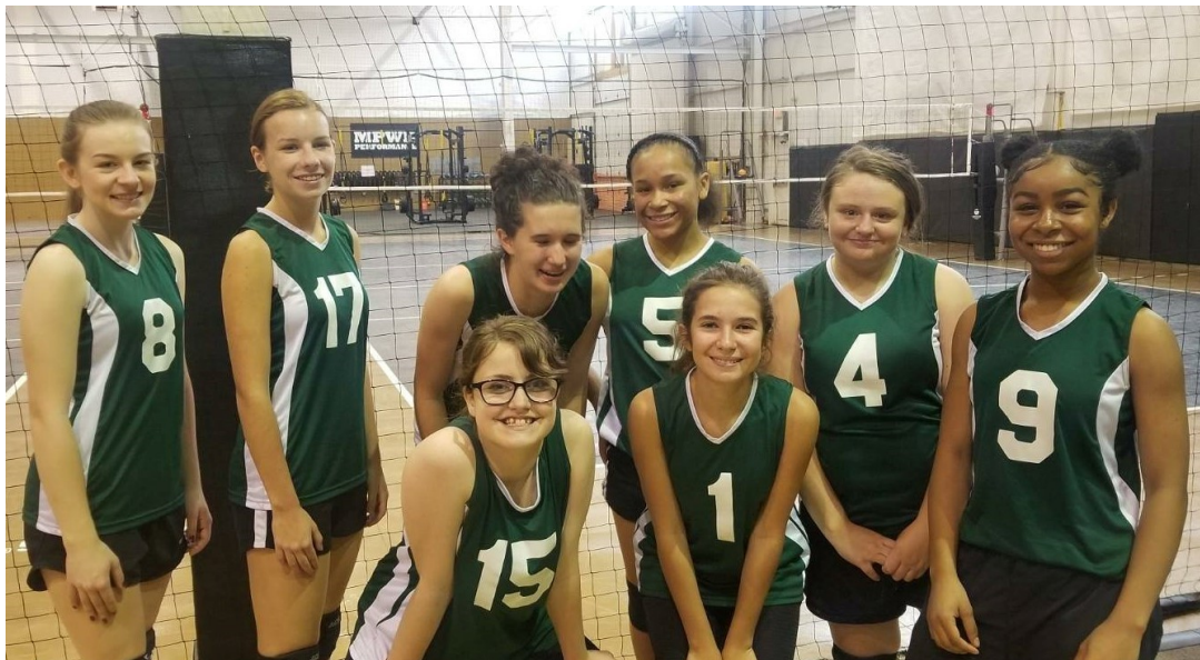
HS Girls volleyball team at their first playoff tournament

Redeemer High School Preview Night and College/Career Fair, Thursday, November 7, 6:30 p.m. (HS preview night open to all prospective HS students, College/Career Fair open to the community).