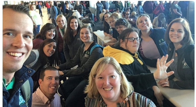
RLS faculty on their way home from LEA Convocation

Redeemer faculty once again took part in the annual Lutheran Educators Association convocation, held this year in St. Louis. Teachers enjoyed insightful seminars, uplifting speakers, and encouraging music. We are thankful for this opportunity for our teachers to be supported and strengthened.