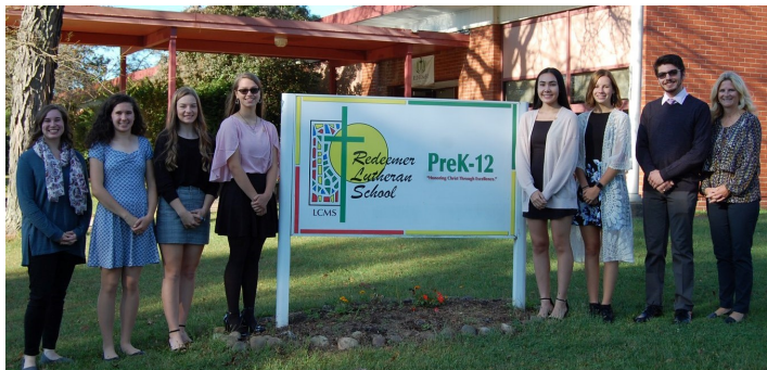
The 2019-2020 RLS National Honor Society Chapter